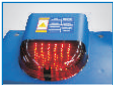
Lighting beacon and level sensor optional