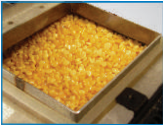
Capacities 4L, 8L, 16L