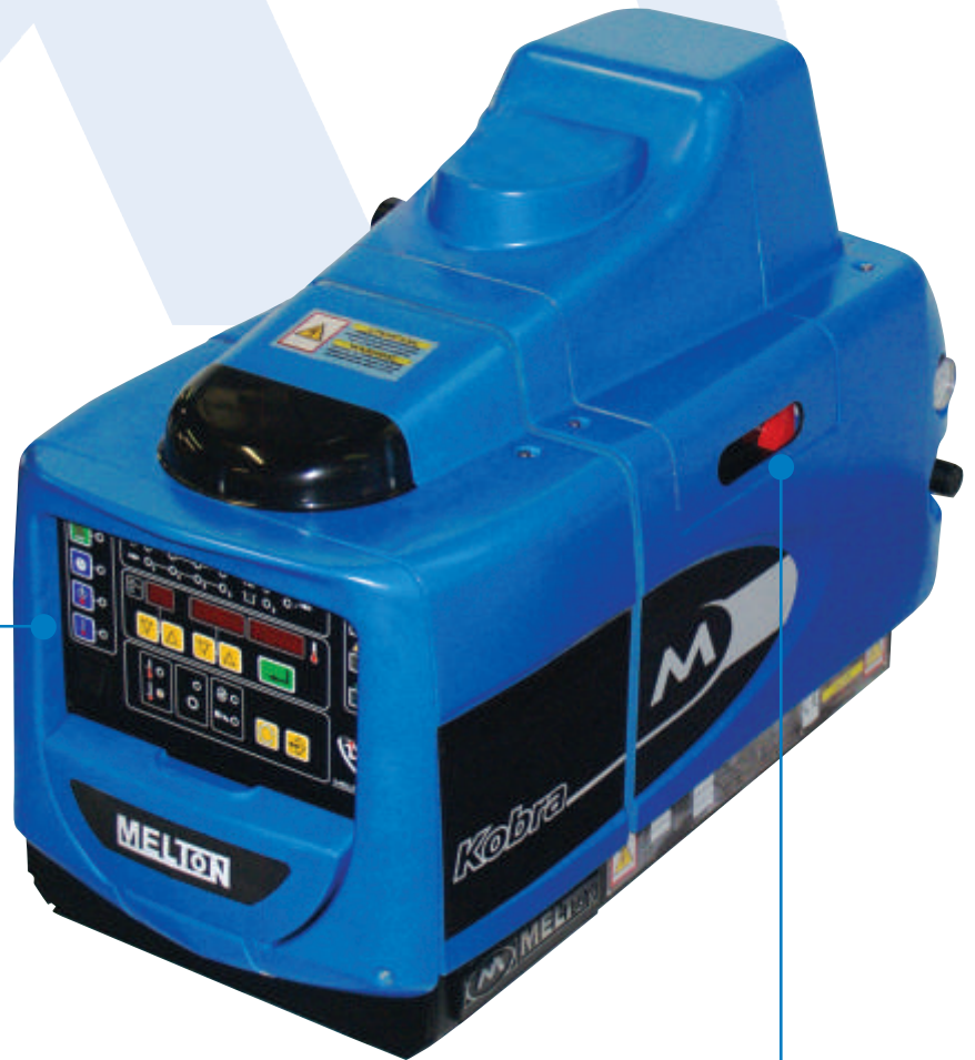
Locking lid promotes operation safety