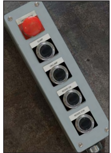
Remote Operator Interface is so simple that operators can be trained to use it in a matter of seconds.