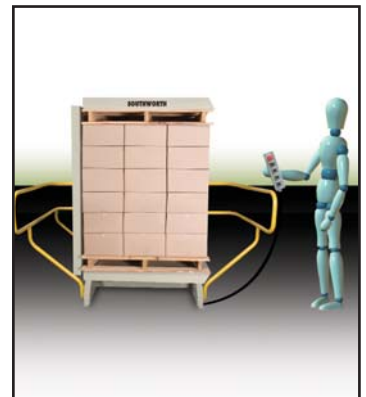
4. Entire cycle takes about a minute.