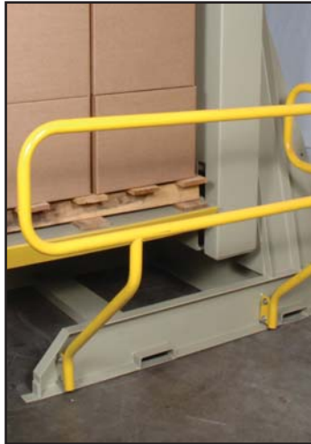
Safety Rail provides a visual alert as well as a physical barrier to protect operators. Fork Pockets allow for easy relocation.