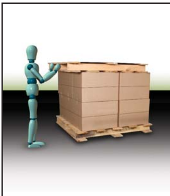
1. Add replacement pallet or slip sheet to top of load.