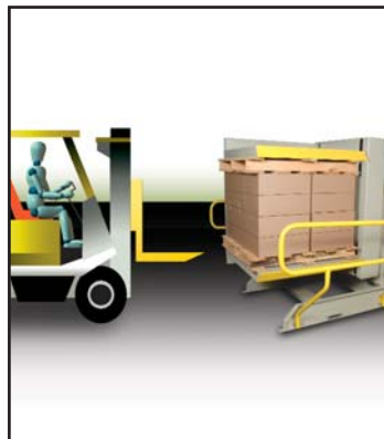
2. Place loaded pallet into inverter.