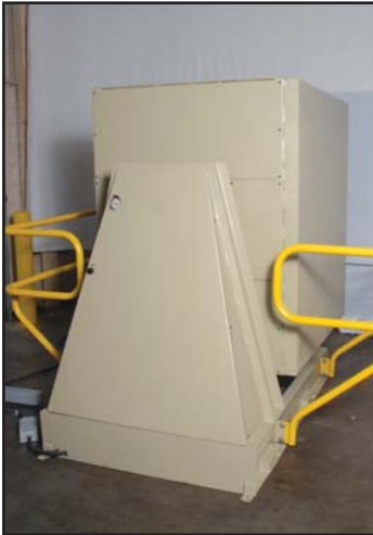
Rugged A-Frame design houses a massive anti-friction turret bearing for smooth rotation with minimal maintenance.