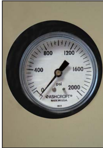
Clamping pressure can be adjusted by the user to prevent crushing of delicate loads.