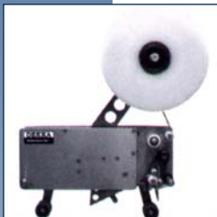
DEKKA Tape Head