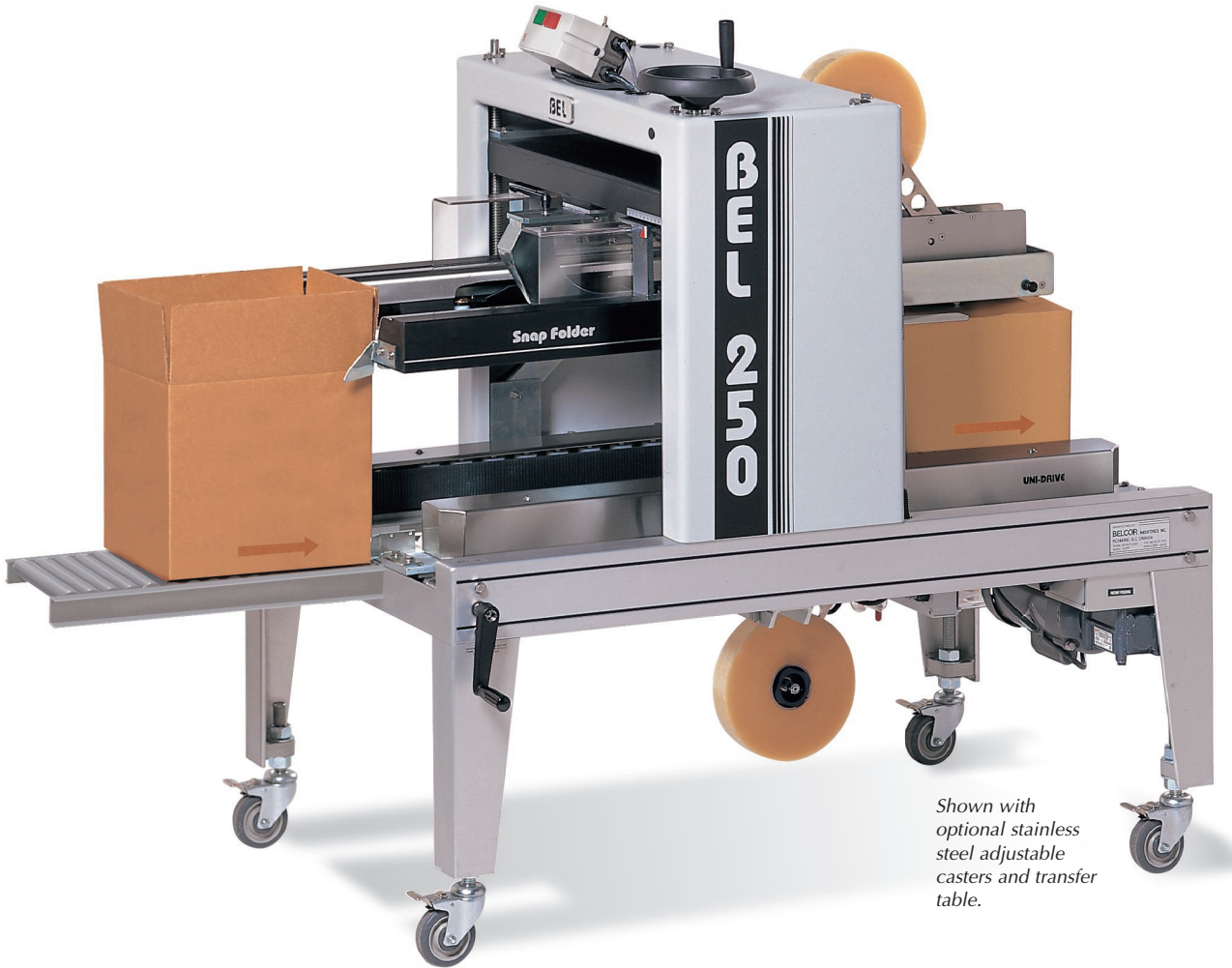
Shown with optional stainless steel adjustable casters and transfer table.