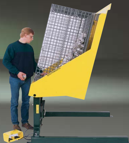
E-Z Reach™ Universal Works with all containers and can be loaded with a hand pallet truck