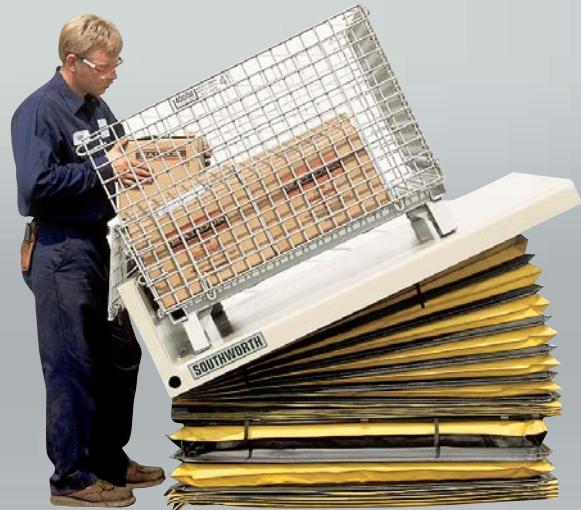
E-Z Reach™ Lift and Tilt For precise positioning of height and angle.