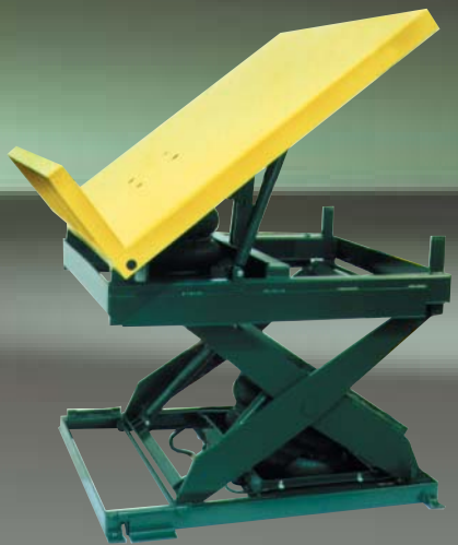
Pneumatic Lift and Tilt Available in lift and tilt or tilt only configurations.