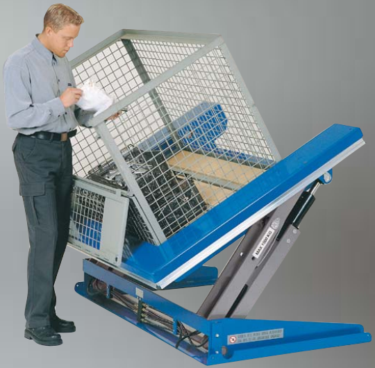
Z-Lift and Tilt Tables™ Lift and tilt with hand pallet truck accessibility.