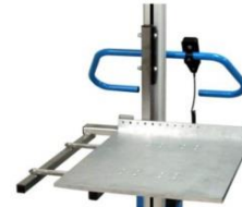
Side-To-Side Moving Platform