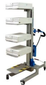
Multi-Level Platforms -Selectable Level Pick-Up