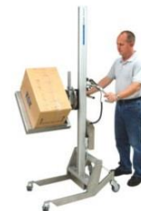
Platform with Manual Rotator