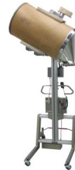
Side Discharge Pour Cone for Valve