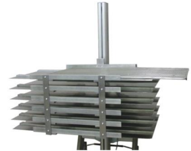
Multi-Level Platforms -Fixed Levels