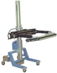
"SUPERDOME" 3070 Test Fixture-350-lbs