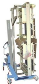
Electronic Panel Assembly