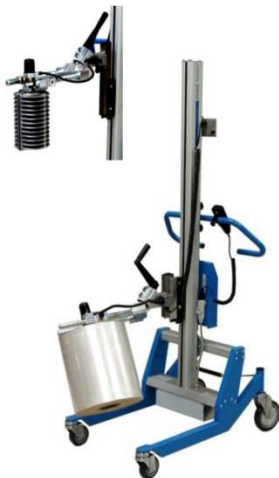
3 7/8" EXPAND-O-TURN®