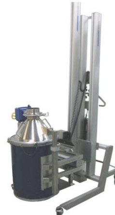
Fiber Drum-Telescopic Mast w/Pour Cone & Valve