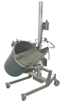
"Brute" Drum w/Pour Chute