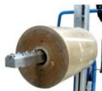
Core Probe -Solid -Wheeled