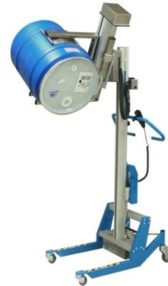
Plastic & Fiber Drums