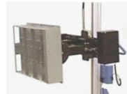
Back Plane Assembly