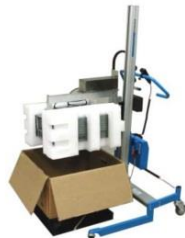
CPU Assembly-Vacuum Lift