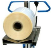
Platform, "V" Block W/Turntable