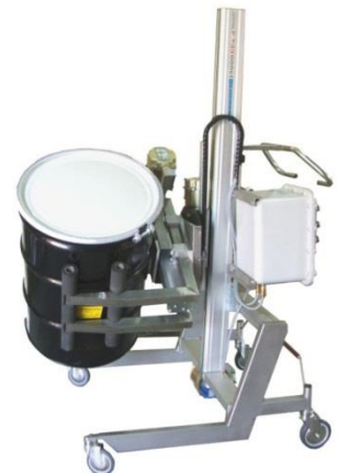
Explosion Proof Lifter