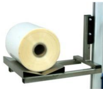
Fixed "V" Block