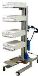
Multiple CPU Handling