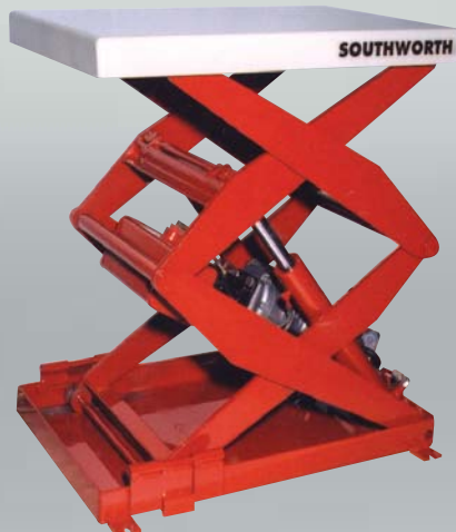
Backsaver Lite™ Compact Tiny footprint with 36" lifting height.