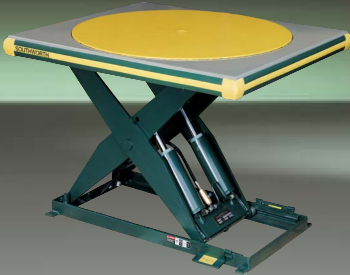
Flush Mount Turntable Lift Move the work around, not the worker.