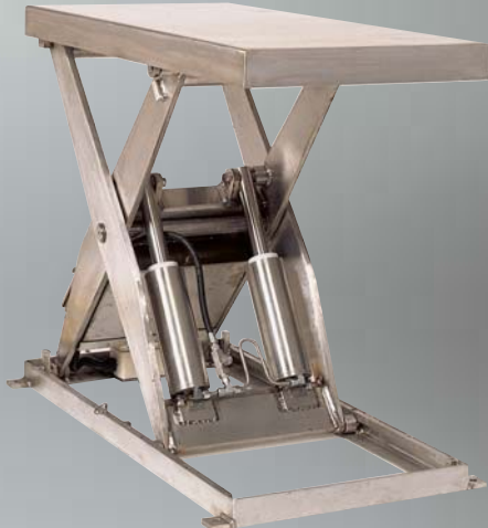
Stainless Steel Lift Tables A wide variety of options for washdown environments.