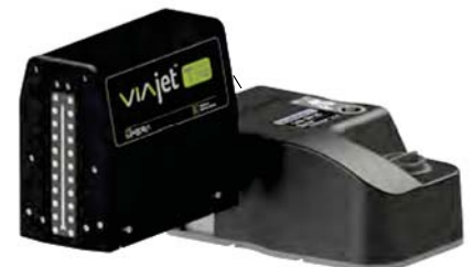
VIAjet™ T-Series T100 Print Head

Pittsburgh, PA | Mölndal, Sweden | Beijing |